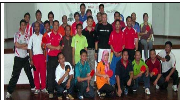
School Teachers Course in Brunei (Nov 12-23, 2008 )